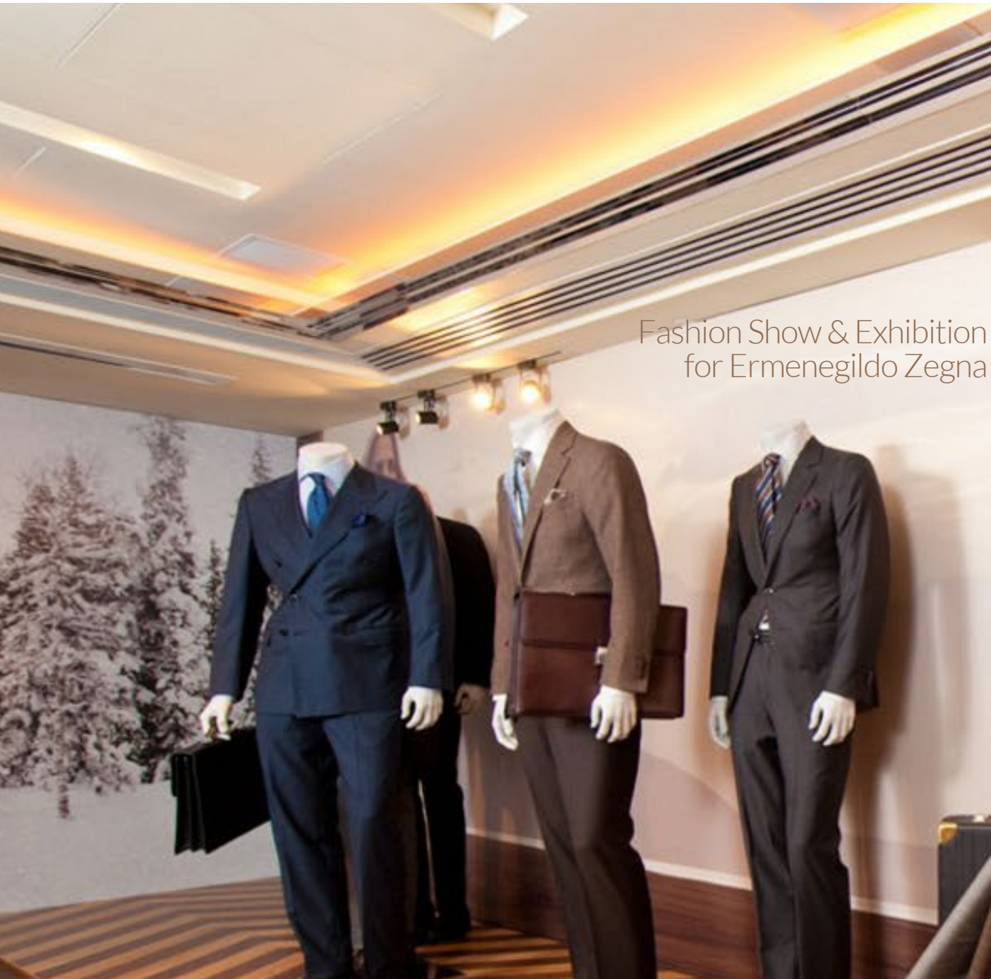
Fashion Show & Exhibition for Ermenegildo Zegna